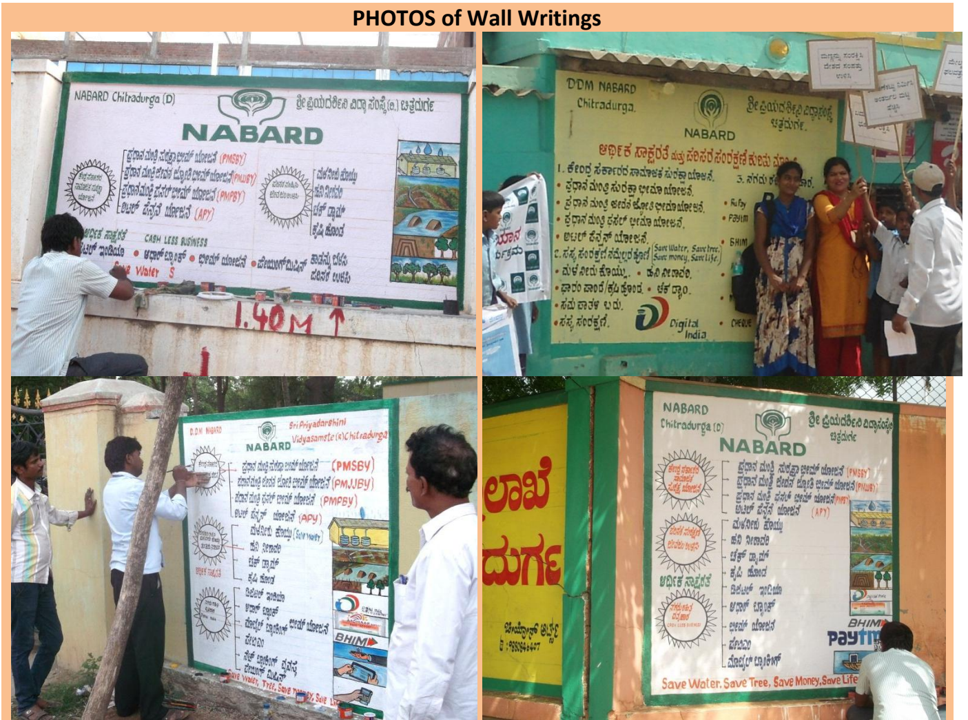
PHOTOS of Wall Writings

About 12 wall writing work was sanctioned by NABARD to conduct awareness on Financial literacy and other Central Government Projects near public areas and office compound wall of panchayat/taluk/department/bank across Chitradurga District. Wall Writing on Financial Literacy awareness program in 12 different places of Chitradurga District was accomplished and report submitted to NABARD.