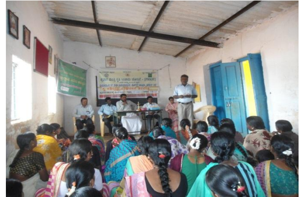
Hosadurga Taluk PMKSY Batch 5th