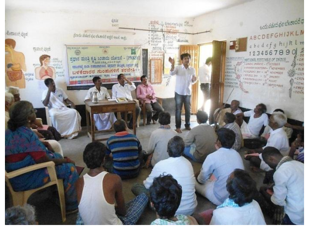
BioFuel Training in Kadabanakatte watershed Chitradurga Taluk