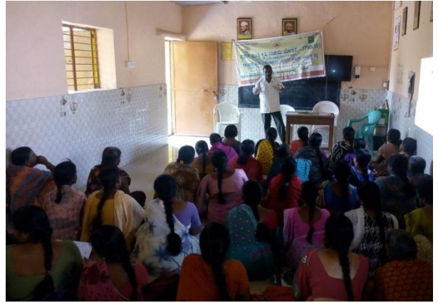
ChitradurgaTaluk PMKSY Batch 6th