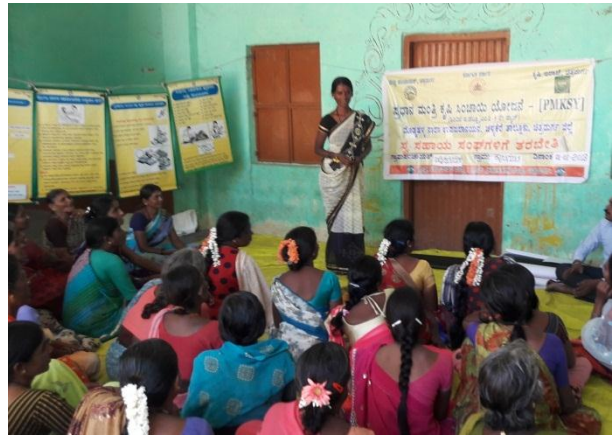
MolkalmuruTalukPMKSY Batch 6th