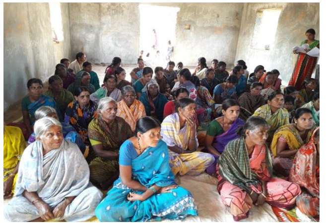
BioFuel Training to SHG members in Bhimsamudra Kere Nala watershed of Holalkere Taluk