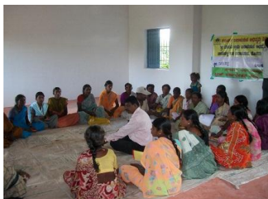
agro-horti farming system

outside the watershed area, with suitable resource persons. Various technical training are imported to selected watershed community to improve their skills in watershed development, agriculture production, live stock and fodder development and