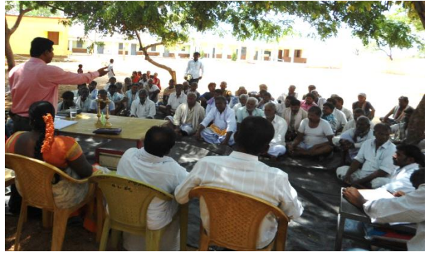
BioFuel Training to Farmers & GP members in Rajapura Nala watershed of Molakalmuru Tq