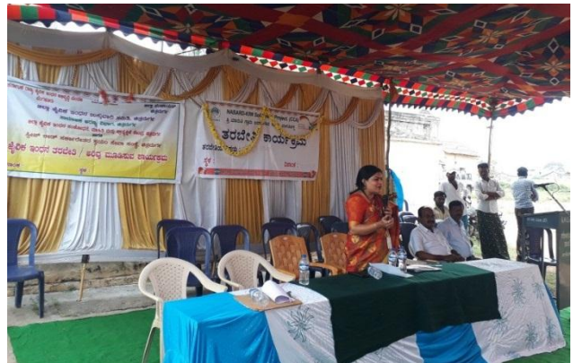
BioFuel Training to VWC members of NABARD Nagathalli watershed of Hosadurga Taluk