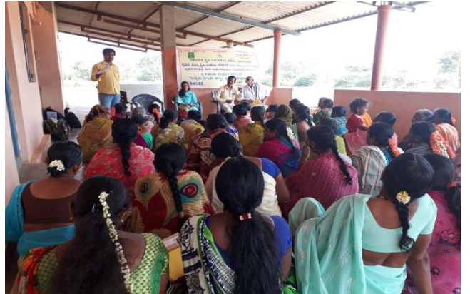
BioFuel Training to SHG members in Vedha Right & Left Nala watershed of Hiriyur Taluk