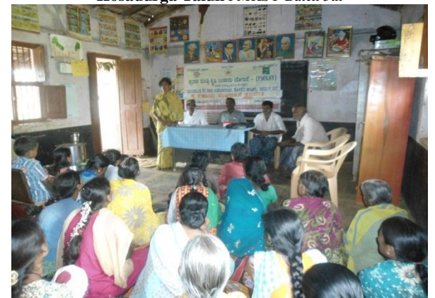
Hosadurga Taluk PMKSY Batch 6th