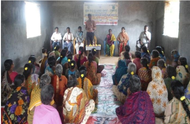
Holallkere TalukPMKSY Batch 6th