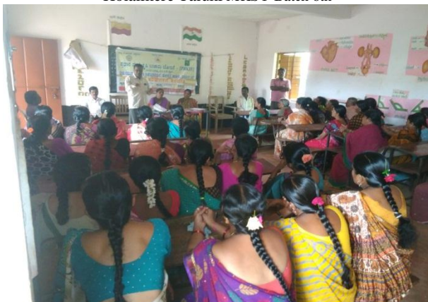
Hiriyur Taluk PMKSY Batch 5th