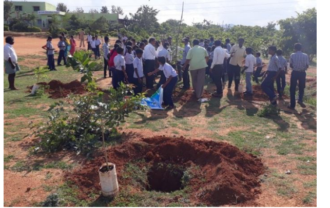
International BioFuel Day Celebration by Planting BioFuel Plantation in School Premises. School Childrens, DFO Social Forestry, Project Co-ordinator I & D Center were also involved in planting.